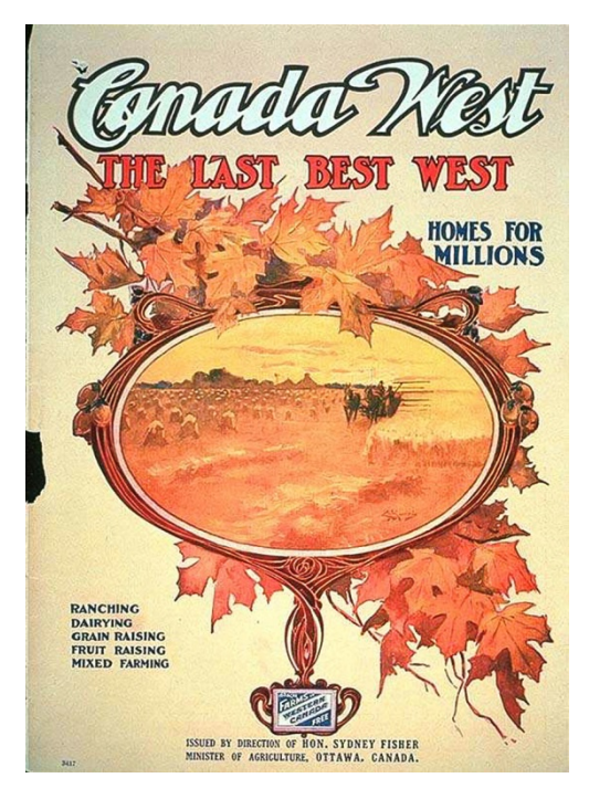
Figure 1: "Canada West" campaign poster, Canadian Museum of History, 1909, Library and Archives Canada.